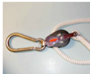
Bottom with Carabiner